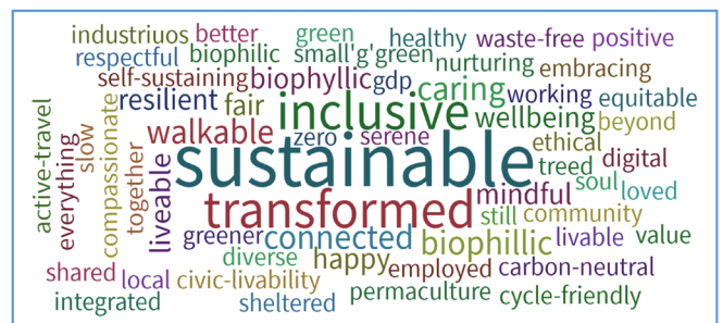
Word cloud 2: Vision for Canberra for 2030–2050

The most popular answer to the question 'What would you like the ACT region to be like in 30 to 50 years?' was sustainable , with 12 entries, and inclusive , with seven (word cloud 2).