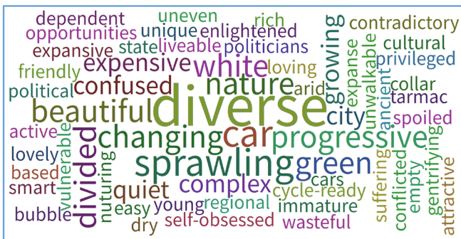
Word cloud 1: Current perceptions of Canberra

Although seven people entered diverse , this meant different things to different people. Some meant diversity of place—the range of environments from the mountains to the coast. Others meant diversity of people—referring to the immigration of people from different places for different reasons.